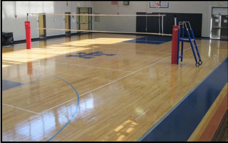
Nashoba Valley Tech.

Specializing in refinishing wood and synthetic floors: