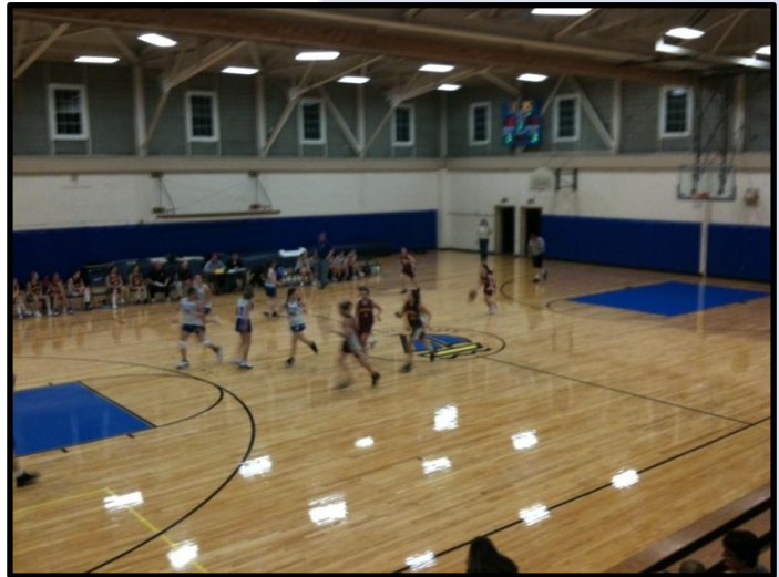
Memorial Gym, Scituate After refinishing