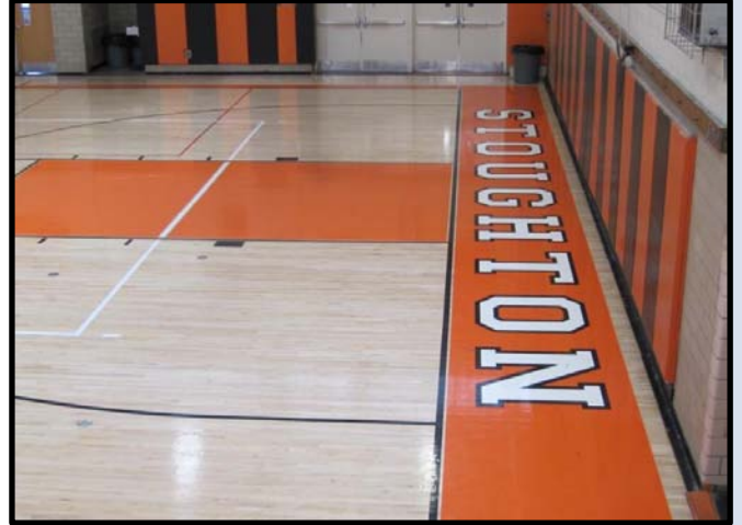
Stoughton High School

Give your school courts a brand new look!